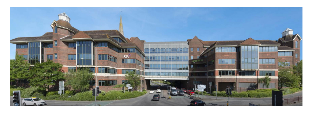
St. Mark's Court, Horsham – 195 units consented