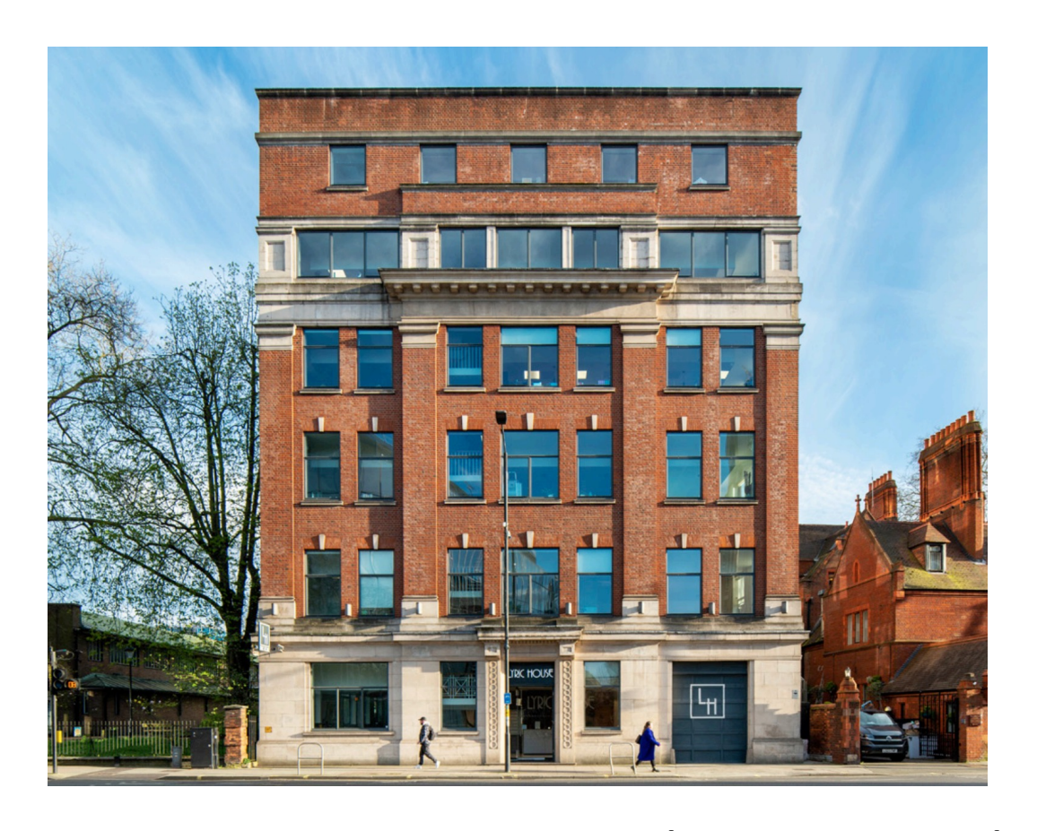
<u>Lyric House, Barons Court – 27 units (planning required)</u>