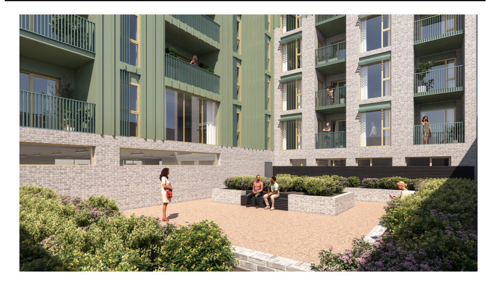
Orchard Gardens, Hove – 42 units consented